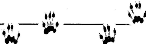
Red Squirrel life size in mud

Tues., 5/9 - O'Melveny Pk/Bee Cyn/Mission Pk - 8:30 a.m. Easy-paced 4-6 mi, 1200' gain hike. Meet at trailhead (Balboa Blvd N, L on Orocozo to Sesnon, L past parking lot, 4-5 blocks to Neon R, park at end of street; possible parking fee). Ldrs: Pixie Klemic, Ramona Dunn. Sierra Club (SFV) Outing.